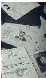
Fake IDs confiscated by police