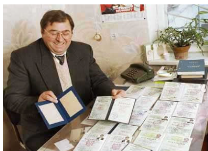
Fake graduation documents

A willing and available university is required for accomplishment of either of the above objectives. Many well-established universities have been mentioned in this connection. Widespread international attention was focused on Moldova’s Free Independent University of Moldova after Romania’s prominent Ecological University, one of the several independent universities to appear in the wake of the collapse of the communist regime in 1989, was implicated in the sale of advanced degrees in dentistry. ULIM’s activities first came to the attention of the Romanian National Council for Academic Evaluation and Accreditation when it was accused of granting doctoral degrees without state authorization 15 . As the National Council investigated the activities of the Ecological University it charged that ULIM was also issuing doctoral degrees in return for participation in a four-week “training program” and payment of a generous amount of money. 16 Most widely commented upon was ULIM’s doctorate in economics, a document that, according to Romanian investigators, was being utilized by many individuals hoping to either advance themselves professionally or to establish new identities. 17