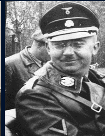
Figure 6: Portrait of Reichsfuehrer-SS Heinrich Himmler. (Portrait of Himmler, n.d., https://collections.usmm.org/search/catalog/pa1151323 )