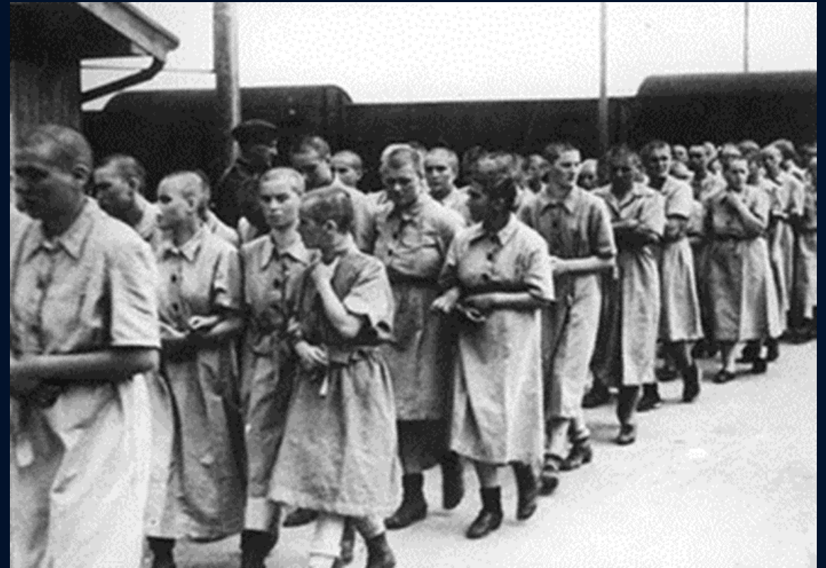
Figure 8: Female prisoners in Auschwitz, walking in lines with their heads shaven