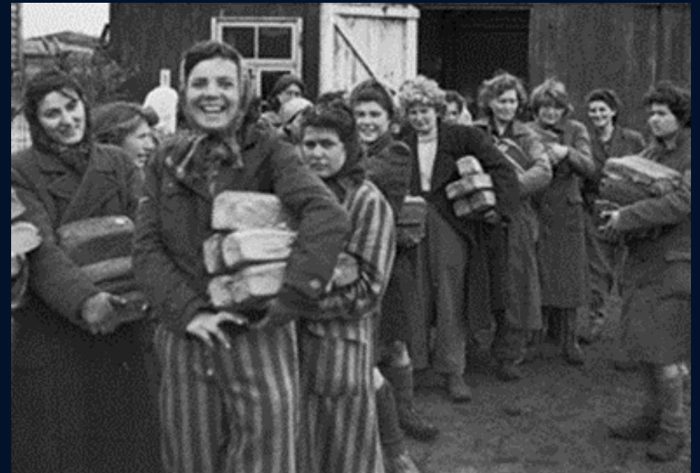
Figure 9: Prisoners of the Bergen-Belsen concentration camp cheerfully collect bread rations upon their liberation by British forces in April 1945. (Women receiving bread rations after liberation, n.d., https://www.royalnavy.mod.uk/news-and-latest-activity/news/2018/january/29/180129-holocaust-memorial-day )