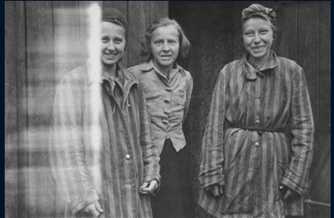
Figure 10: Liberated female prisoners in the womens' camp at Woebbelin. (Women smiling now that they have been liberated, n.d., https://collections.ushmm.org/search/catalog/pa1039411 )