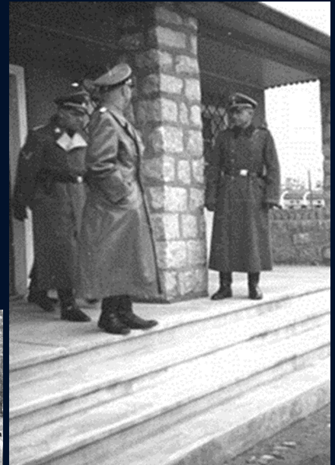
Figure 4: Himmler standing on the steps of the Mauthausen concentration camp brothel in October 1941 (Himmler at the barracks, n.d., https://www.dailymail.co.uk/news/article-4976754/The-Auschwitz-BROTHEL-prisoners-rewarded.html )