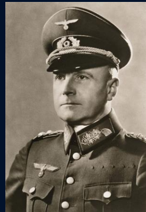
Figure 5: Field Marshal Walther von Brauchitsch (1881-1948), commander in chief of the German Army.