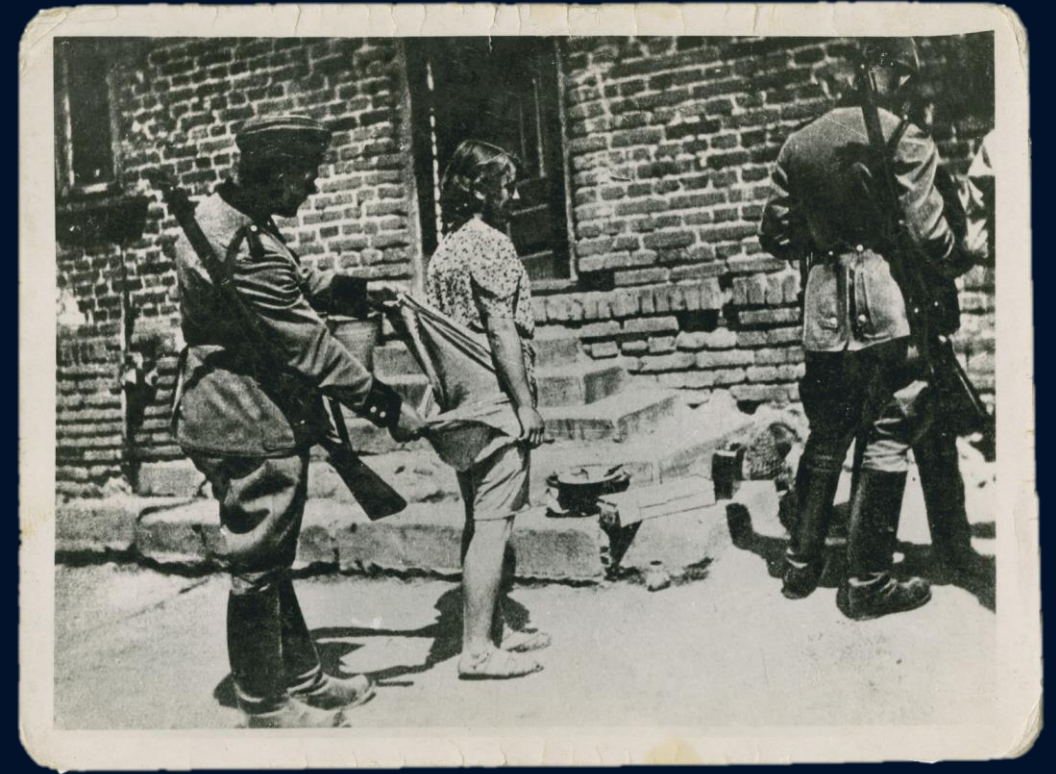
Figure 7: An armed Nazi searches a woman by pulling down her underwear. (An armed Nazi searches a woman by pulling down her underwear, n.d., https://collections.ushmm.org/search/catalog/pa1180296 )